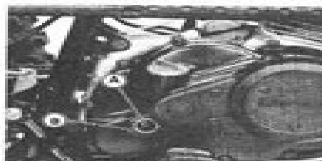
Oil level sight glass (A) and level marks (B)