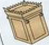
Altar of Incense