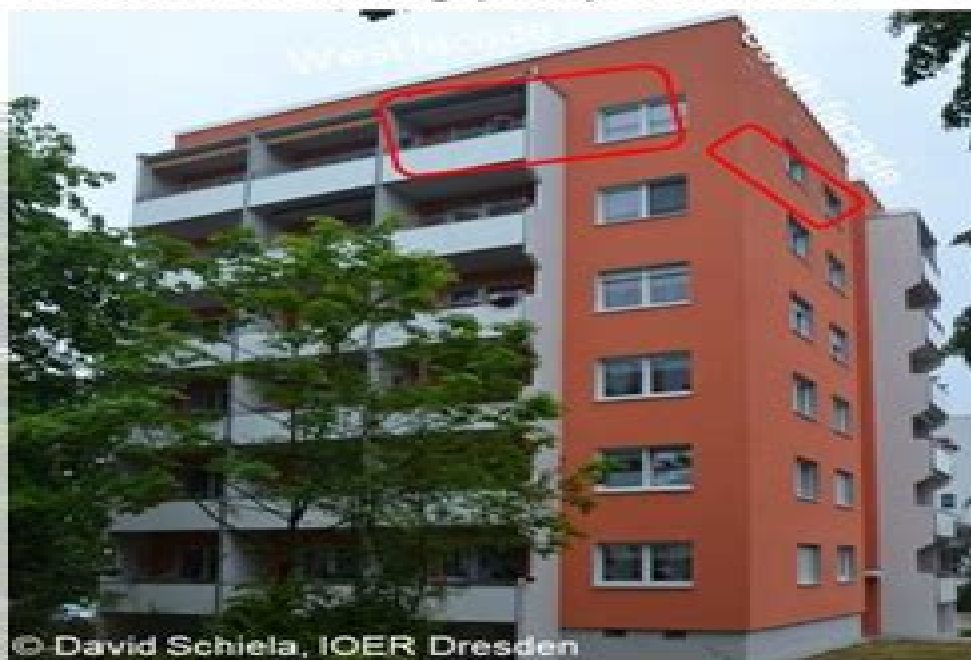
a Low-rise building (LRB): Side view