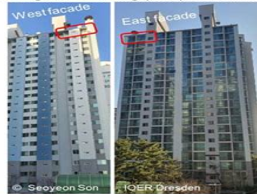
b High-rise building (HRB): Side view