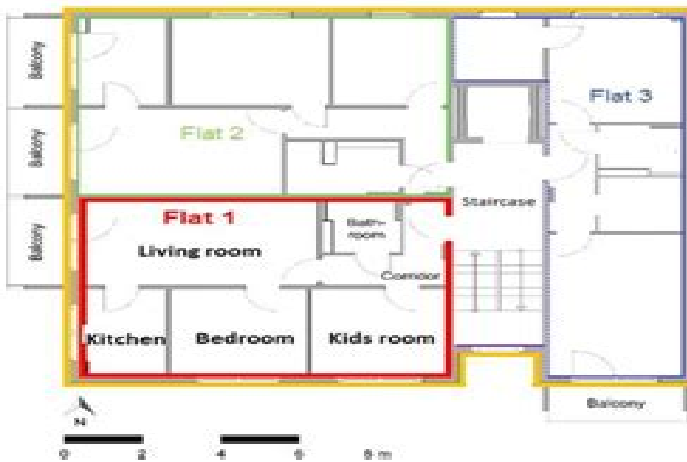
c Low-rise building (LRB): floor plan