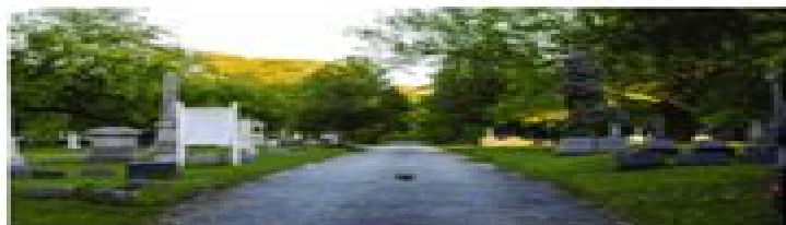
Modern stone of this pavilion, first, presented in ancient, and intended to traditions.