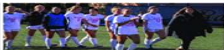
The women's soccer team will enter the Athletic Center to cheer on their Red Sox off with.