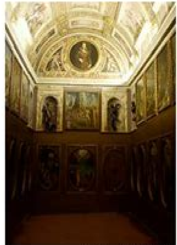
Francesco I studiolo, 1570

- Jacques Chirac: Europeana (2008) Gives access to over 20million objects from 34 countries