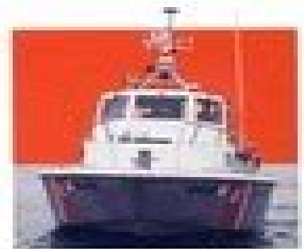
Coast Guard boat