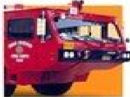
crash rescue rig