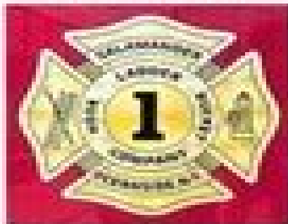
fire engine badge