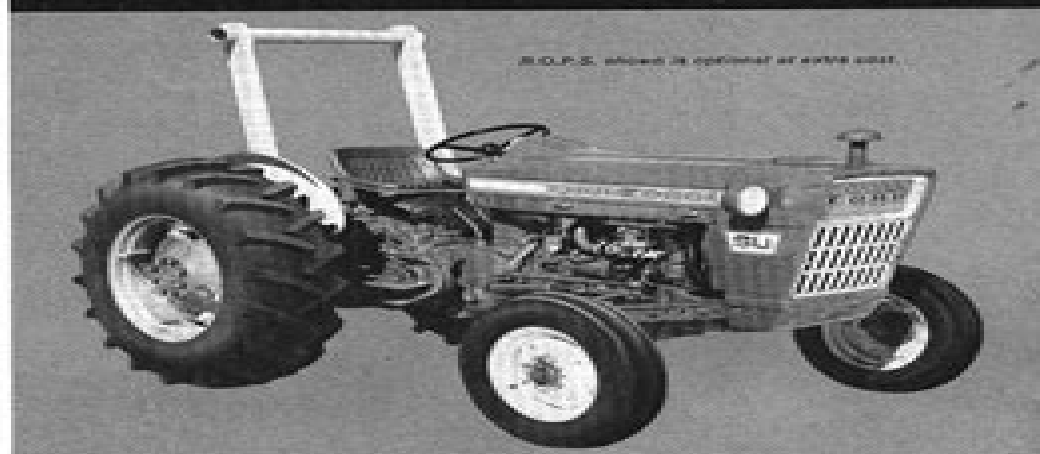
P.O.P.S. shown is optional at extra cost.