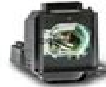
TV Lamp 9150400001 with Mounting for Mitsubishi TV $25.75 ★★★★★ = 4