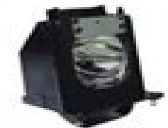
TV Lamp 9157001014 for 9175000001, 91757100, WD-67114, WD-67023, WD-65733, WD-65724, WD-65653, WD-73723 $25.00 More Details View $25.00