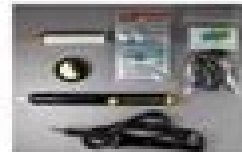
LED 42LCTD42B PCB-PW EAP067807H LCD TV Complete Repair Kit w/ 21 Capacitors and Soldering Accessories (Soldering Iron) $29.21 ★★★★★ = 3