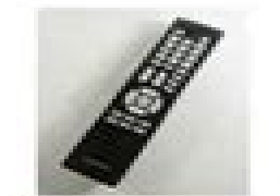
Whisper Remote Control Part Number 2007000000 $24.00 More Details View $24.00