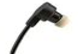
TV 6000 4000T Ear Taps for TV Earbuds $25.00 ★★★★★ = 3