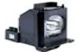
9150400001 - Lamp With Mounting $25.00 ★★★★★ = 4