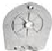
Wireguard WP-3023 Antenna Base Plate 102 $15.00 ★★★★★ = 3