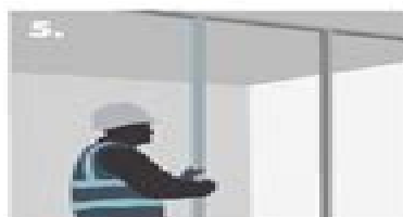
Inserting timber ground into jamb stud door opening.