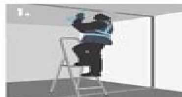
Fixing the head track.

All 900mm wide 15mm Knauf Soundshield Plus boards should be offered up to the frame with the face of the board outwards and secured with Knauf Screws at maximum 400mm centres. Fixing centres should be reduced to 200mm at corners. Boarding should commence at one end and work across the partition. At head, floor and abutments, board edges should be bedded onto continuous beads of Knauf Sealant. Tape and joint for a seamless finish.