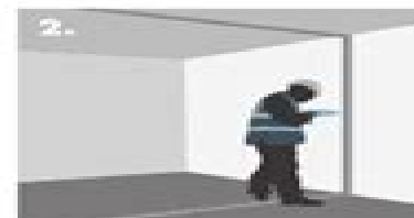
Fixing the first stud to the adjoining wall.