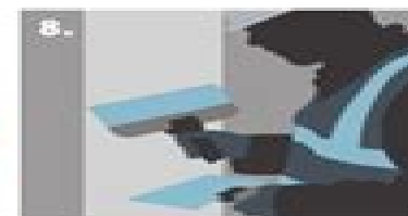
Tape and joint for a seamless finish.