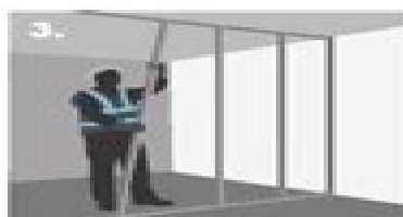
Twisting Knauf Acoustic 'C' Studs into position.