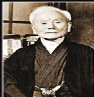
Gichin Funakoshi KARATEDO