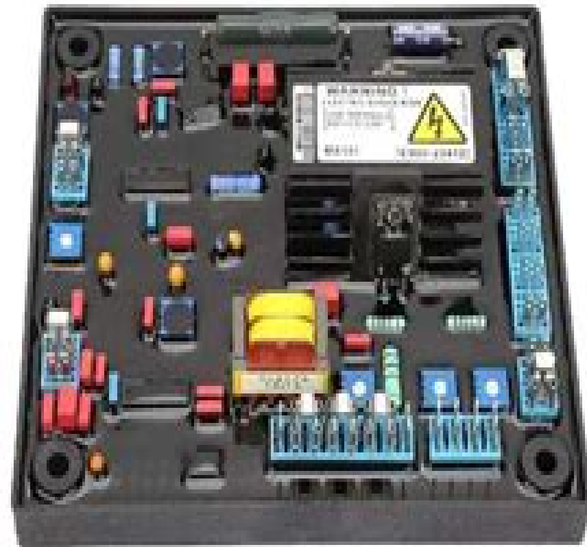
WIRING AND DIAGRAM