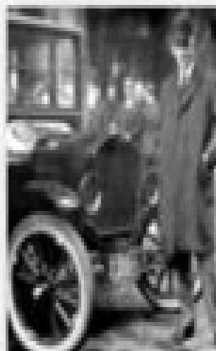
Henry Ford avec son modèle T en 1921