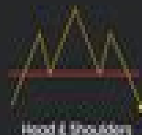
Head & Shoulders