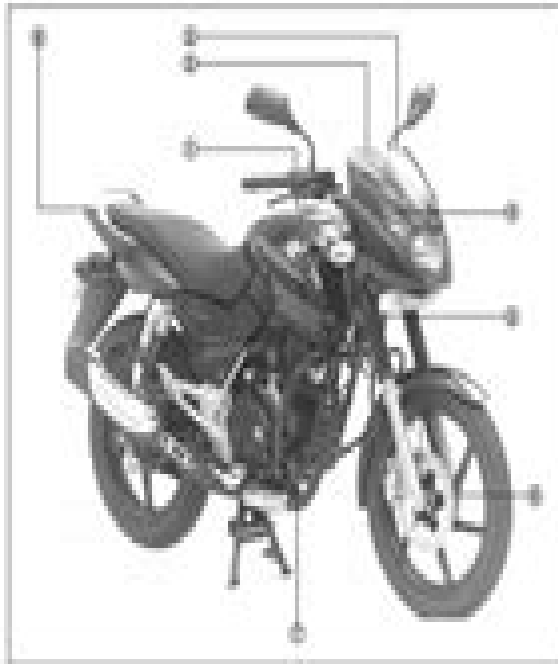
1. Control Switch 2. Fuel Sensor for Indicator