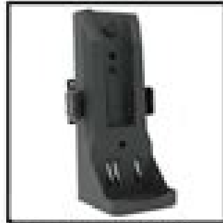
Leipoldt GPL 900