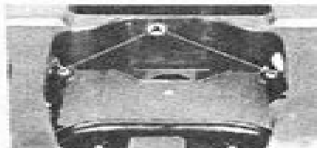
Air cleaner cover screws (A)