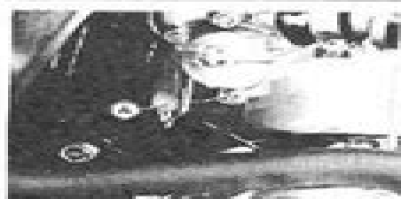
Carburetor float bowl drain plug (A)

CAUTION: Be sure to do this in a well-ventilated area a safe distance from sparks or open flames.