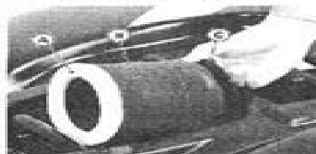
Filter element gasket (A), element (B) and holder (C)