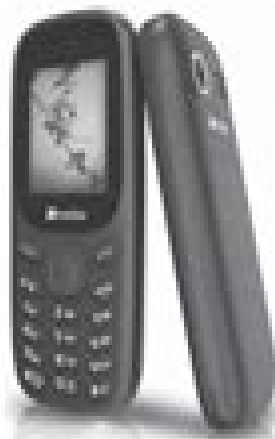
MANUAL DE USUARIO BMOBILE K370