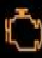
Check engine warning light