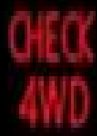
Check 4WD warning light