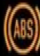
ABS warning light