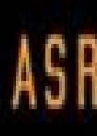
ASR indicator light