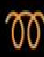
Glow plug indicator light