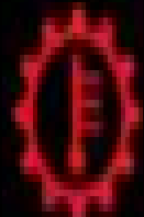
Automatic transmission fluid temperature