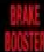
Brake booster warning light