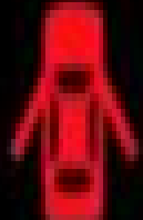
Door open warning light