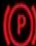
Parking brake warning light