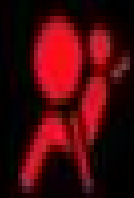
SRS airbag warning light