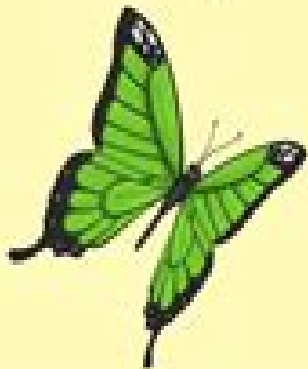
Cairns Birdwing Butterfly