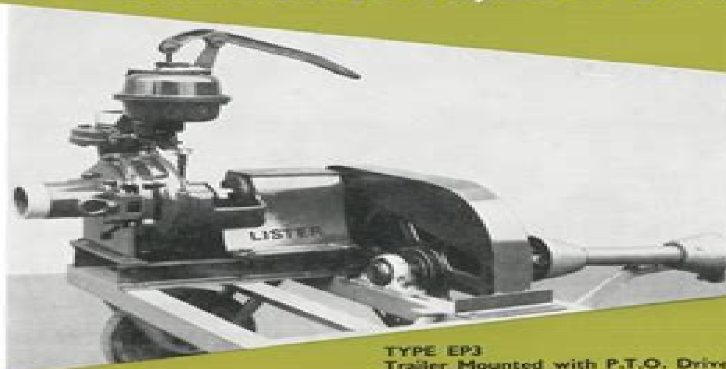
TYPE EP3 Trailer Mounted with P.T.O. Drive