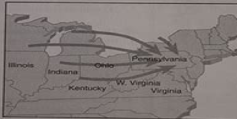
Movement of Air Pollution

30 The diagram below represents how air pollution may move across the eastern United States.