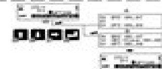
Fig. 3 Hydraulic system diagram showing the flow of hydraulic fluid through the pump, valves, and hoses.