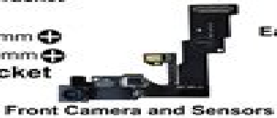
Front Camera and Sensors