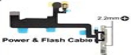
Power & Flash Cable