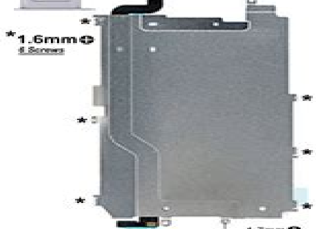
LCD Shield Plate