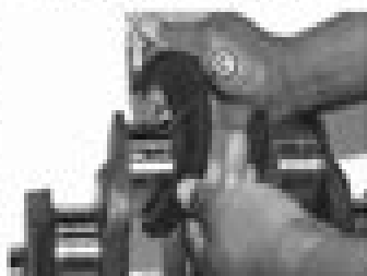
Measuring Crankshaft Main Bearing Journal OD

Replace or resurface crankshaft if it does not fall within above specifications.