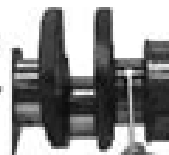
Measuring Main Thrust Journal Width