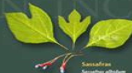
Sassafras Sassafras albidum