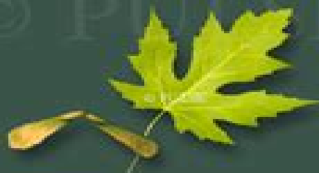
Silver Maple Acer saccharinum