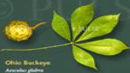
Ohio Buckeye Amelanchier glabra