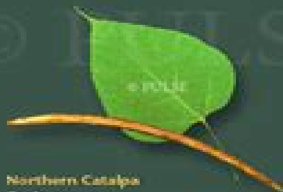
Northern Catalpa Catalpa speciosa