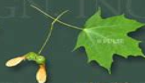
Sugar Maple Acer saccharum