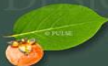
Common Persimmon Diospyros virginiana