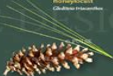
Eastern White Pine Pinus strobus