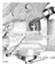
Figure 26-1—Diesel Engine Oil Level

If oil level is low in either engine, add sufficient good, clean oil to bring the level up to the "full" mark on the dip stick.