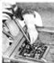
Figure 26-4—Checking Battery Specific Gravity

If liquid level is too low to check, add distilled water. It will then be necessary to run the engine for a few hours before the water and electrolyte will mix.