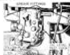
Figure 26-5—Power-Train Oil Plug and Oil Level Vent

If the tractor is equipped with Power-Train, open the oil level vent (Figure 26-5) and see if oil runs out. If it does not, add good clean SAE 14-W oil until it does.