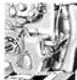
Figure 26-6—Power Shaft Clutch Housing Filler Plug

If the tractor is equipped with an engine-driven "low" power shaft, check the oil level in the shaft by removing the filler plug (Figure 26-6). Oil level should be up to level of bottom thread in filler opening. If it is not, add good clean SAE 14-W oil until its level is correct.