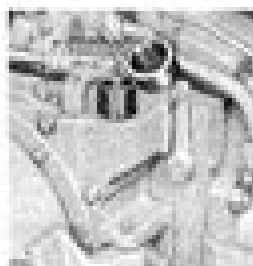
Figure 26-3—Diesel Engine Oil Filter