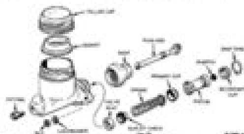
FIG. 10 - Master Cylinder With Standard Brake System

When disassembling a master cylinder head with a Bendix, remove the piston assembly, cup, seat and the spring, and check valve assembly from the cylinder bore. Remove the spring from the piston (Fig. 11).