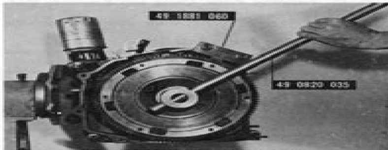
Fig. 1-77 Tightening flywheel nut