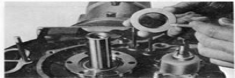
Fig. 1-78 Fitting thrust plate