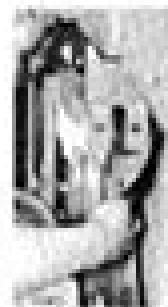
Figure 25-25-2—Removing Governor-to-Reference Linkage

Detach Governor-to-Reference Linkage. Disconnect governor-to-reference linkage from reference.