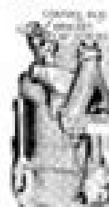
Figure 25-25-5—Removing Governor-to-Throttle Control Rod Linkage

Detach Governor-to-Throttle Control Rod Linkage. Disconnect governor-to-throttle control linkage from throttle control rod (Figure 25-25-5). Loosen governor-to-throttle control rod fast bracket (Figure 25-25-6) by removing two wing screws which hold it to control manifold.