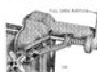
Figure 25-25-7—Removing Governor-to-Throttle Control Rod Linkage

Throttle Control Rod Fast Bracket. Slip throttle control rod line of throttle control rod from bracket. Remove carrier pin carrier key from rear bracket from fly carrier pin line of bracket.