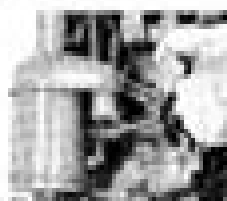
Figure 25-25-1—Removing Air Throttle

Normal operation of the engine demands largely upon proper operation of governor. The Model "M" governor is specifically designed to give low governing performance between speeds of 1800 R.P.M. full load rated engine speed and over 3000 R.P.M. full load.