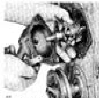
Figure 25-25-6—Removing Governor-to-Throttle Control Rod Fast Bracket

Remove Governor. Remove governor attaching wing screws and work governor out line of front gear cover. Slip governor shaft into