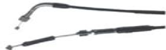
T5 STYLE THROTTLE CABLES