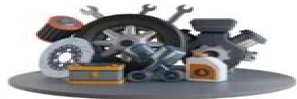
Using Aftermarket Parts