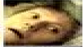
Michael Keaton as Noah Galt