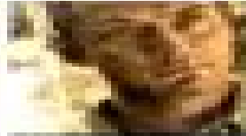
Jesse Eisenberg as David Galt