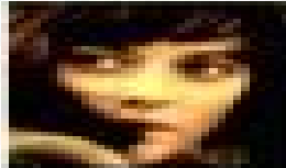
Marion Cotillard as Jennifer Parker