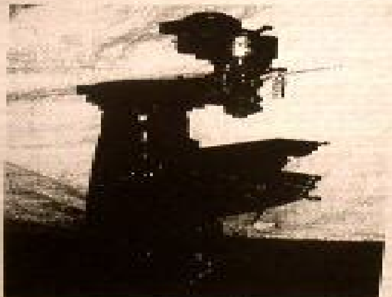
Table Size: 36" x 9" Table Travel: 25" x 12"