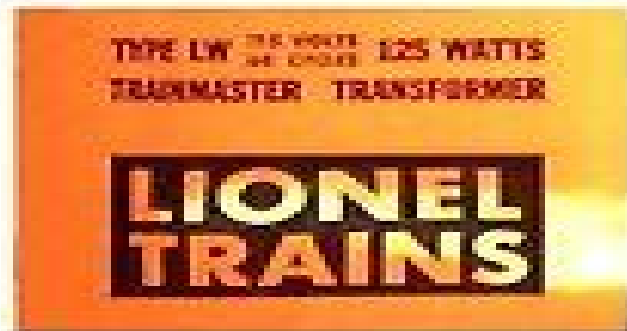
FOR THE TYPE LW