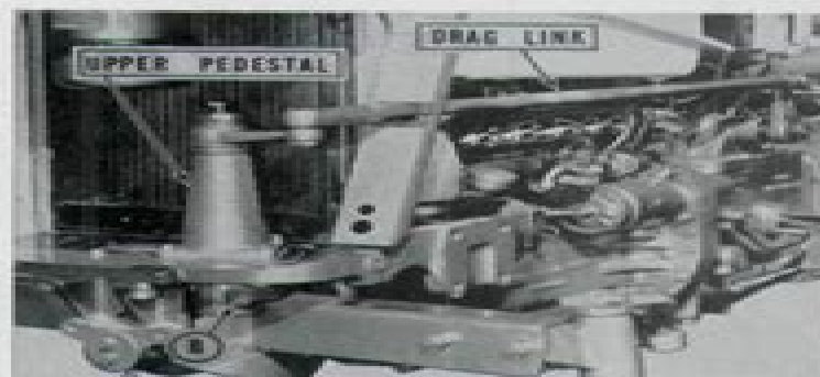
Fig. MF238—Upper pedestal and drag link installation on models F40, MH50 & MF50 equipped with manual steering and adjustable type front axle. The installation on tricycle models is similar except for details of the lower steering arm.

Remove pitman arm from lever shaft and remove the gear housing side cover (18—Fig. MF237). Withdraw the lever shaft and stud assembly. Examine the stud and renew same if damaged or excessively worn. Note: