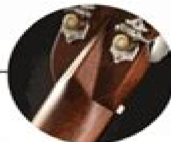
Long diamond neck transition*