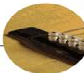
GE modern belly bridge with bone or ebony bridge pins