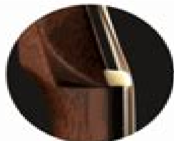
Nut on angle transition from fingerboard to headstock