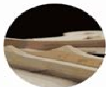
Golden Era (GE) top bracing