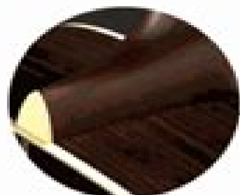
Sleeker vintage-style heel