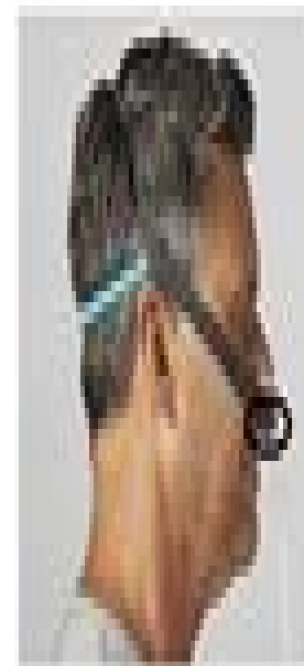
Figure 5 : masque de traitement 3100 NC/SP