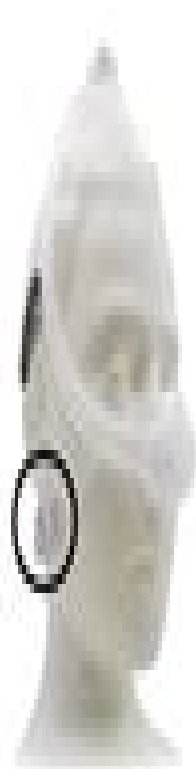
Figure 2 : masque nasal DreamWisp