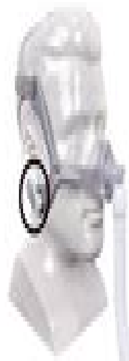
Figure 4 : masques nasaux Wisp et Wisp Youth