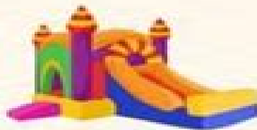
Indoor Inflatable Park