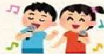
Karaoke and live DJ