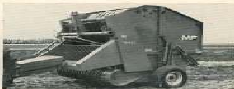
MF 1560 BALER