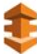
AWS Direct Connect