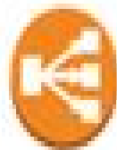
Elastic Load Balancing