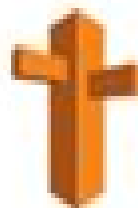
Amazon Route 53