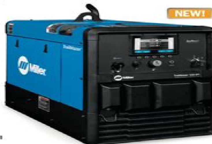
Trailblazer 330 EFI with ArcReach and optional Excel power shown.

Parameter control at the wire feeder or pendant without needing a control cord. See page 2.