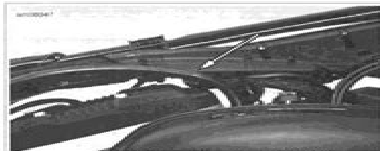
Figure 3-12. EVAP Purge Hose Barbed Cable Strap