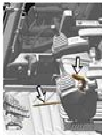
Figure 2 Hydraulic activation control lever - LOCKED position