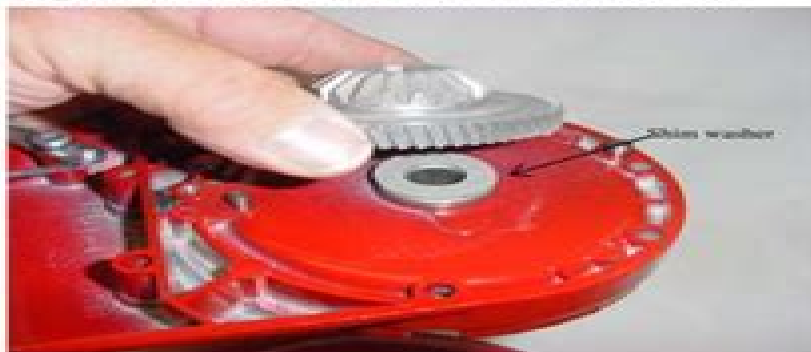
Fig. 55 Bevel center gear being lifted for inspection.