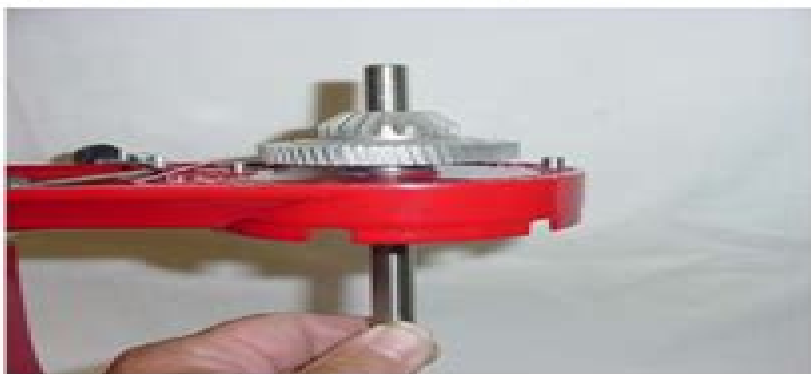
Fig. 54 Removal of vertical shaft from bottom cover.