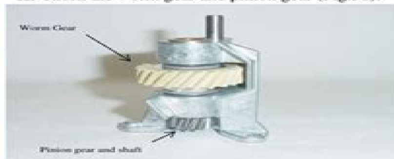
Fig. 56 Check worm gear and pinion before reassemble.

To replace these gears, drive out the groove pin (Fig. 57).