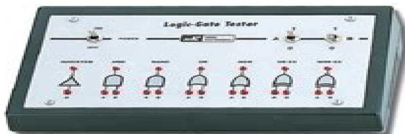
Figure 602 : Vous vous rendrez vite compte de l'utilité de cette table de vérité électronique, car elle vous permettra de savoir instantanément quel niveau logique sera présent sur la sortie d'une porte, simplement en modifiant les niveaux logiques sur les entrées.

port, car il n'est pas rare qu'une broche sorte à l'extérieur ou bien qu'elle se replie vers l'intérieur. En utilisant de petits morceaux de fil gainé, soudez les broches des inverseurs S1, S2 et S3 sur les pistes du circuit imprimé, comme indiqué sur la figure 598.