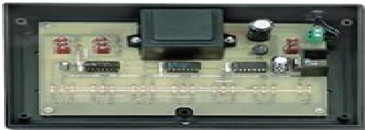
Figure 599 : Photo du circuit imprimé vu du côté des composants. Les LED devront être montées sur le côté opposé.