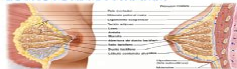
Figura 1 - Estrutura da mama.