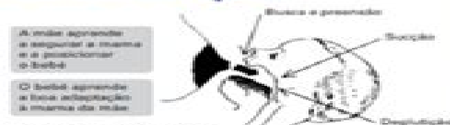
Figura 2 - Reflexos do bebé