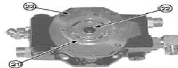
Cheng, H. and H. H. Hsu. 2001. The effects of water temperature and dissolved oxygen on the growth of juvenile grass carp ( Cyprinus carpio L.). Journal of the World Aquaculture Society 32:103-110.

Source: http://www.census.gov/hhes/education/data/tables.html