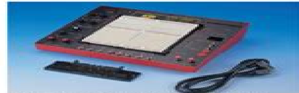
Figure 1: ETS-7000 (Digital Analog Trainer)