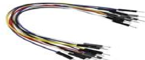
Figure 3: Jumper Wires