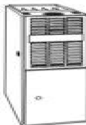
Fig. 3—Model 58PAV Upflow