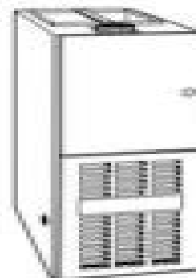
Fig. 2—Model 58RAV Downflow