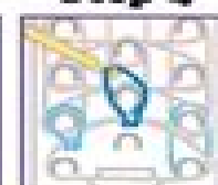
Loop the blue band straight up to the next pin