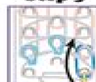
Grab the blue band on the right pin