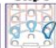
Loop the blue band straight up to the next pin

Step 7: Continue picking up and looping the bands until you reach the top of the loom. Finish the bracelet with a white extension and C-clip. (see reverse)