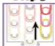
Place bands on the right row of pins