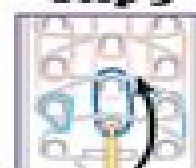
Grab the blue band on the center pin